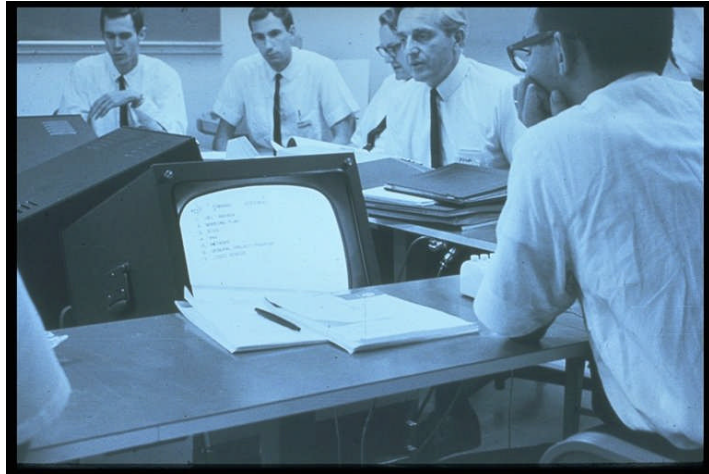
Engelbart and his team at the Augmentation Research Center use an early collaborative computing system during the late 1960s.