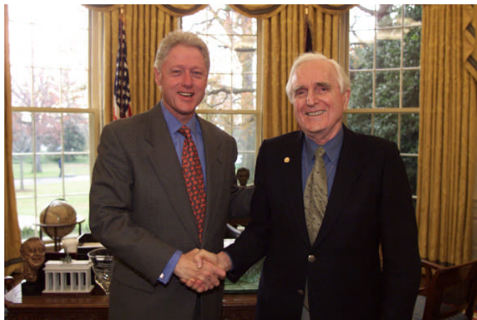
In 2000, President Clinton presented Engelbart with the prestigious National Medal of Technology.